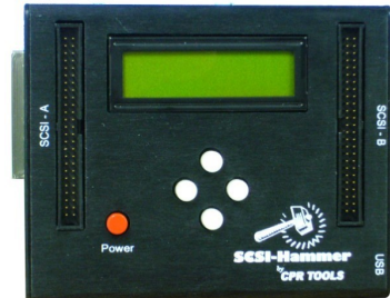
The SCSI Hammer™