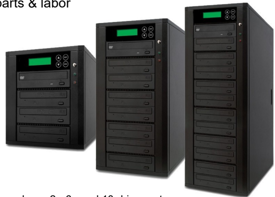
Image shows 2-, 6-, and 10-drive systems.