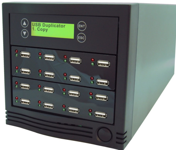
Image shows 15-drive option.

The Pro-USB Duplicators are compatible with USB stick 2.0, 3.0, USB-HDD 2.0, 3.0, and other USB devices. The duplicators support all types of data-format copying while doing bit-for-bit duplication.