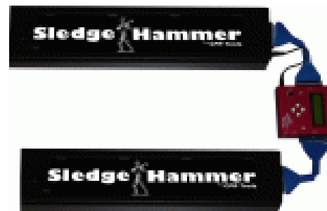
The Sledge Hammer™

For The Hammer, PSIClone and associated adapters