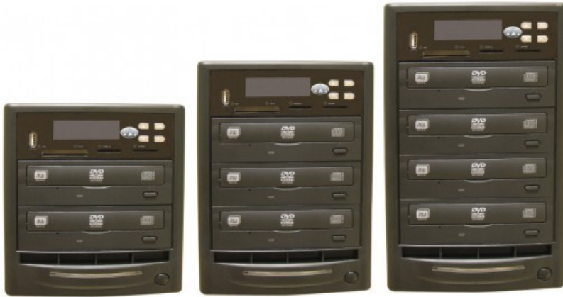
Image shows 2-, 3- and 4-drive systems.

Backup your important data from erasable memory cards or flash drives to CDs, DVDs or Blu-ray! The CRI PF Series Flash Duplicators are your all-in-one, stand-alone solution for data backup and disc duplication. No hard drive required., the CRI PF Series Flash Duplicators have a compact and stylish design with multiple memory card and USB drive readers built in. Intelligent multi-session and disc-spanning technologies make data transfer as easy as one touch of a button. The CRI PF Series Flash Duplicators are also disc-duplicators that copy up to 3 discs at a time. Experience all the benefits that the CRI PF Series Flash Duplicators/Flash Multimedia Backup System has to offer. Able to copy SD, Flash and memory cards up to 32 GB. See exFAT-capable duplicators for greater than 32GB capacity.