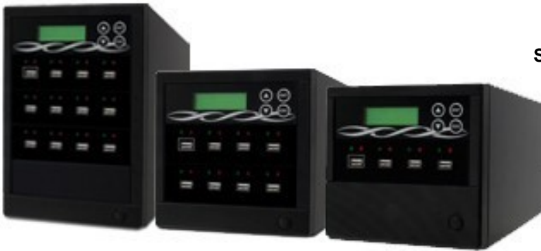
Image shows 11-, 7- and 3-drive options.

The Pro-USB Duplicators conveniently copy portable USB storage drives and external USB hard drives without the use of a computer . Advanced asynchronous duplication means no waiting and no interruption because each channel can independently load, unload and copy. The Pro-USB Duplicators also feature user-friendly 4-key control with LCD, high-speed duplication and a bit-by-bit “Compare” function to confirm successful duplication.