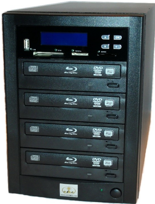
Image shows 4-drive system.

The world's first exFAT-capable USB/memory card duplicator and backup system. Now, back up your important data from erasable memory cards or flash drives to archival CDs, DVDs or even 100GB BDs and 128GB BDXL. The CRI ProFlash Duplicator is your all-in-one, stand-alone solution for data backup and disc duplication. No hard drive required. The CRI PFD has a compact and stylish design with multiple memory card and USB drive readers built in. Intelligent Multi-Session and Disc Spanning Technologies make data transfer as easy as one touch of a button. The CRI PFD is also a disc duplicator that copies up to three discs at a time in the 4-BD model.